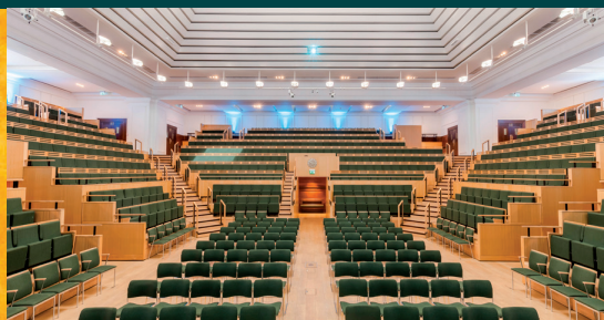
The Light Concert Hall

Promoted by The Classical Road Show Reg Charity No 1017635